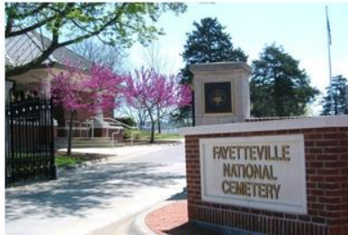
Fayetteville National Cemetery