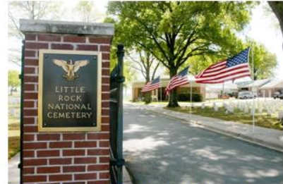
Little Rock National Cemetery