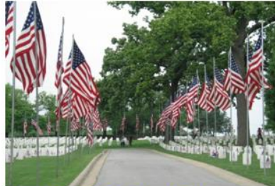
Fort Smith National Cemetery